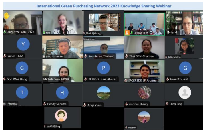
IGPN 2023 Knowledge Sharing Webinar to Strengthen Collaborations

——<Sustainable Public Procurement 2022 Global Review>