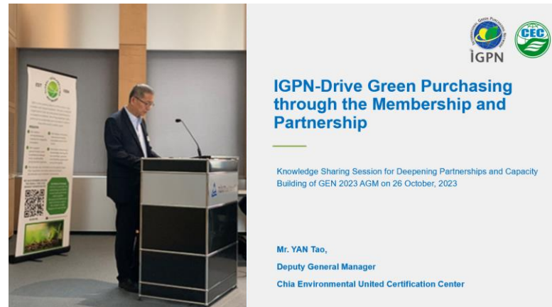
Participate in GEN 2023 AGM introduce IGPN role to Drive Green Purchasing through Partnership